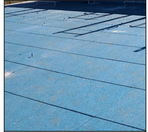
3. Secure anchor bolts