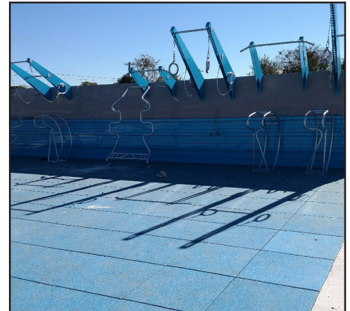
6. Finished wall and floor elements