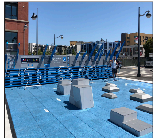
9. Fully assembled Fitness Court