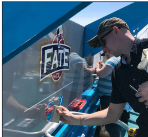
8. Apply custom decals