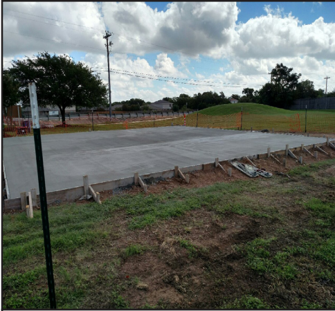
1. Pour concrete slab