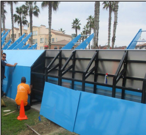
4. Assemble Fitness Court wall