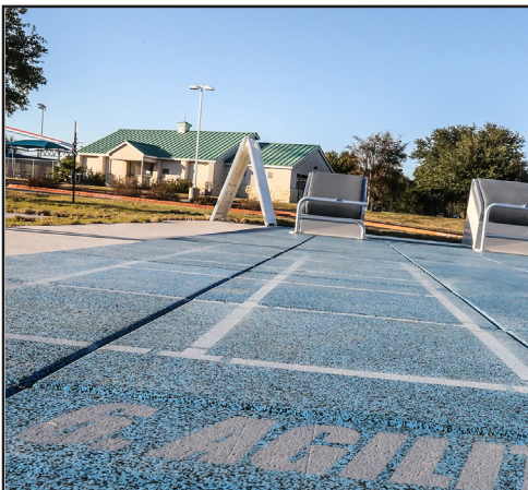
7. Spray floor markings