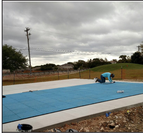
2. Install tile